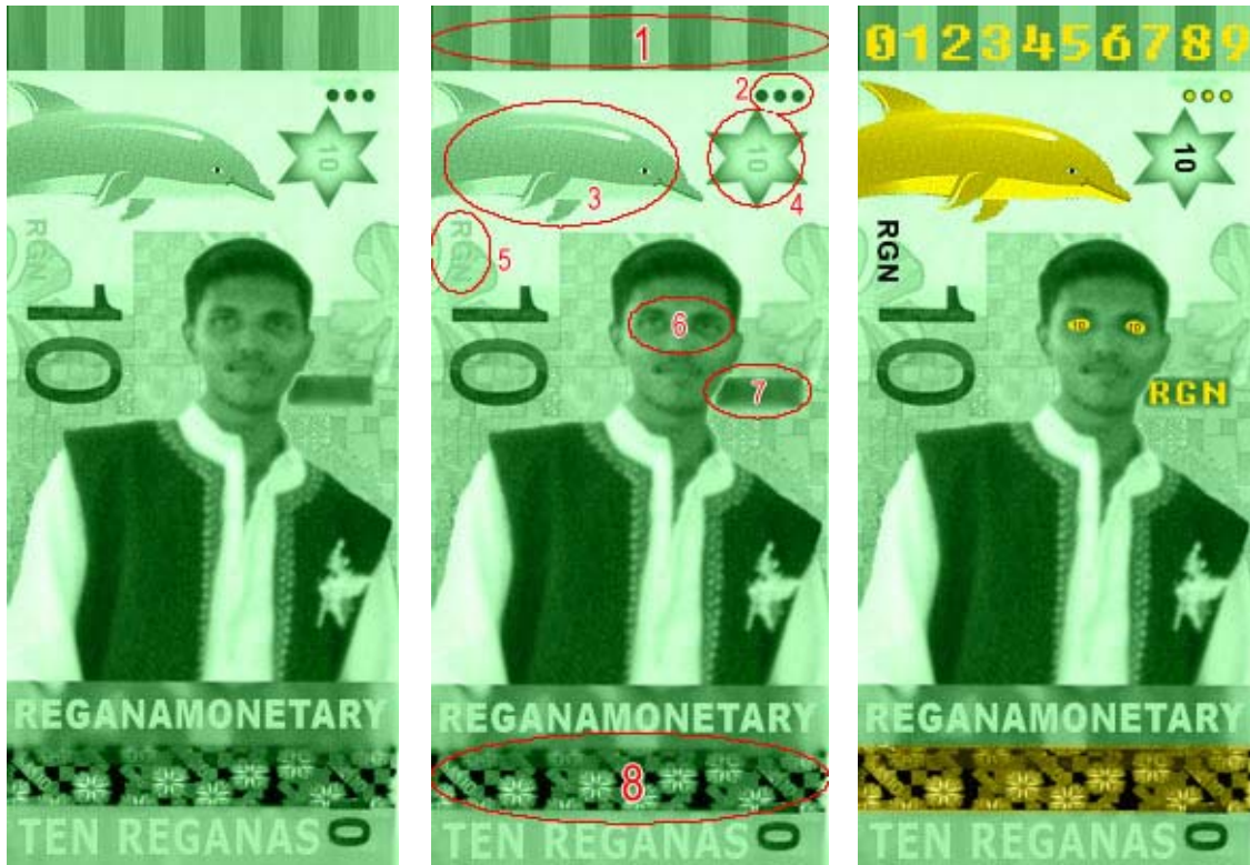
Normal View (Local View)